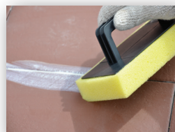
Applying the grout

Note: Unfavourable weather conditions (e.g. extremely hot, strong wind, high temperature, etc.) or highly absorbent substrate can drastically reduce the open time.