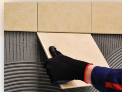
Place tile onto the adhesive bed

- Spread no more than 1 m 2 at a time to prevent Skin-Over. In normal ambient temperature and humidity conditions, the open time of Ezi GREY FIX is approximately 15 minutes.