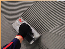
Spread paste on the substrate