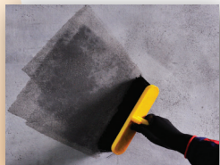
Make sure the surface is clean