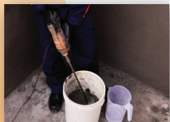
Prepare the mix