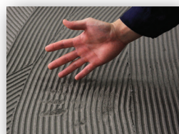
Adhesive bed is no longer sticky "Skin-Over"