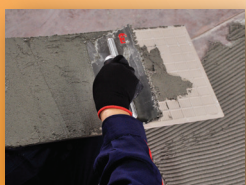
Spread paste on the back of tile