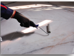
Apply Ezi PREMIUM 1 SEAL to the top surface of natural stones with a brush or roller.

(3) Applying the Sealer - Apply Ezi PREMIUM 1 SEAL onto the surface of natural stones/tiles using brush/roller. - Recommended to be applied with thin even coats. Do not overload brush/roller to avoid excessive single coat application.