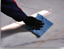
Ensure the substrate to be treated is free of contaminants.

(1) Preparing the Substrate - Substrate to be treated must be dry, sound and free of contaminants, e.g. dust, grease, laitance, oil, etc.