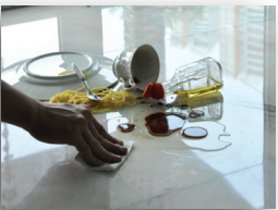
It achieves "Touch Dry" within 2 to 4 hours while its water repellent properties progressively develop within 24 hours. Attainment of maximum properties in 5 days.

- Certain natural stones may require two treatment coats for better water repellent result, otherwise single coat protective treatment is sufficient. - To determine the number of treatment coats required, it is recommendable to check the porosity of materials. Basically low porosity materials require 1-2 coats of treatment; whereas porous materials may require 2 or more treatment coats.