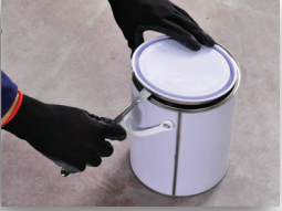
Use directly from the container.

(1) Preparing the Substrate - Substrate to be treated must be dry, sound and free of contaminants, e.g. dust, grease, laitance, oil, etc.