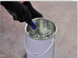
Stir well the sealer before use.

(2) Preparing the Sealer - Use directly from the container. Strictly ensure brush/roller is clean at all times as constant re-dipping of application roller/brush with accumulated dirt/dust will eventually contaminate the remaining sealer in the container. - Stir Ezi PREMIUM 1 SEAL consistently/well before use. No further dilution is required.