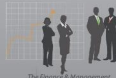
The Finance & Management