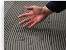
Adhesive bed is no longer sticky - "Skin-Over"