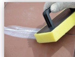
Applying the grout

Note: Unfavourable weather conditions (e.g. extremely hot, strong wind, high temperature, etc.) or highly absorbent substrate can drastically reduce the open time.