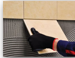
Place tile onto the adhesive bed

- Spread no more than 1 m 2 at a time to prevent Skin-Over. In normal ambient temperature and humidity conditions, the open time of Ezi STAR FIX is approximately 15 minutes.