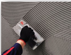
Spread paste on the substrate