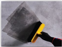
Make sure the surface is clean